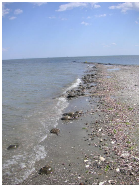
Spawning crabs at Penfield Reef

◆ Staff analyzed data from the long-term horseshoe crab tagging program carried out by Marine Fisheries staff along with 12-14 nonprofit groups and led by Sacred Heart University faculty. These primitive animals are a 'keystone species' and their abundance is a indication of near-shore productivity, while their eggs are an important food source for migrating shorebirds. Tag return data collected over the last decade indicates that the smallest sites support 1-2 thousand spawning adults, while intermediate-size beaches fluctuate between 4-12 thousand and the most productive sites tally 10-40 thousand crabs. These data will be further examined for abundance trends and factors affecting the crabs' spawning success.