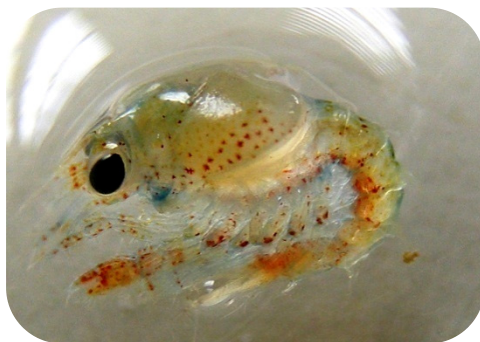
Newly hatched lobster.

◆ Staff attended meetings of the New England Fisheries Management Council's Whiting Plan Development Team. The team is continuing to develop Amendment 19 to the Small Mesh Multi Species Management Plan. Under this plan, annual catch limits and accountability measures will be established for both the northern and southern stocks of Silver and Red Hake.